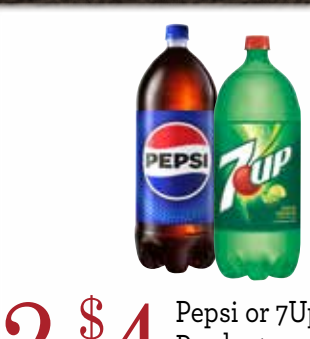
Pepsi or 7Up Products