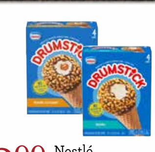
Nestlé Drumstick Selected, 4 count