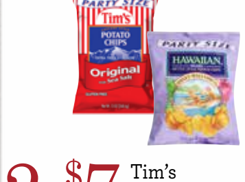
Tim's Party Size Chips Selected, 13 oz.