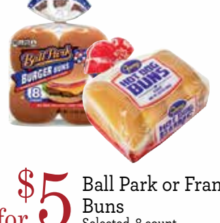
Ball Park or Franz Selected, 8 count