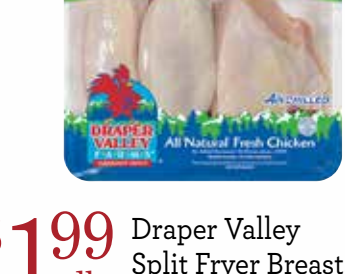
Split Fryer Breasts Value Pack